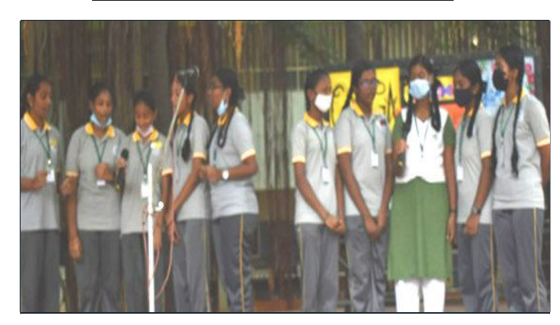
II PLACE - CAUVERY HOUSE