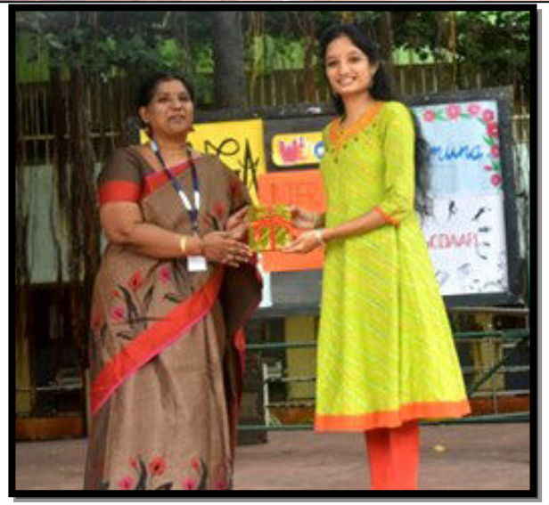
Activity 9 Results of Instrumental Music -LEVEL I