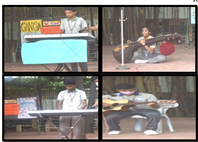
Results of Instrumental Music - LEVEL II