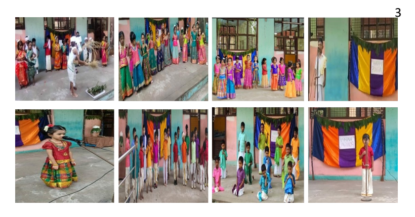
நடுநிலைப் பள்ளி மற்றும் உயர்நிலைப் பள்ளி பொங்கல் விழா

The Pongal festival is held dear, particularly by the farming community as it marks the end of the harvesting season. The Pongal festival in our nursery was celebrated on 13.01.2023 as a true manifestation of our rich culture and traditions. Our school was decorated with Kolam made of many dots, sugarcane, big fat pots, and mango leaves. Our tiny tots spoke about Pongal, enacted a Pongal dance drama, and gave a splendid dance performance for various Pongal songs. The dances were at their vibrant best. Every moment was enriching for the kids who were able to experience typical Pongal celebrations.